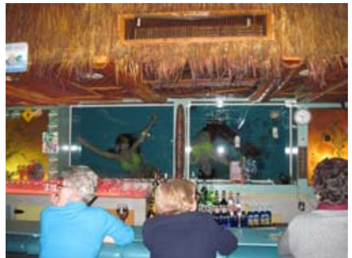
Friday Night Mermaid Swim at the Great Falls landmark Sip 'n Dip.