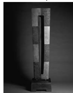
Feast , hand forged steel, by David Secrest, 7' x 20" x 20"

NEW ACQUISITIONS: WORKS OF BLACKFEET ARTISTS GARY SCHILDT AND KING KUKA (1946-2004)