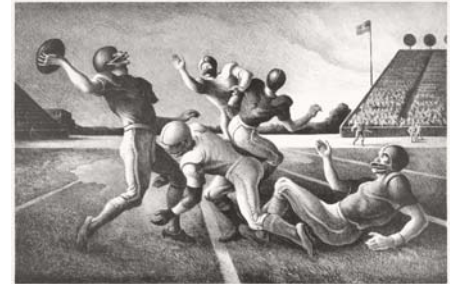
Forward Pass , lithograph, 1972, 13 x 20 inches, by Thomas Hart Benton, Private Collection

View classic scenes that symbolize the American way of life through the familiar works of American Regionalist artist Thomas Hart Benton (1889-1975). Benton belonged to the last generation of artists that wanted to provide Americans with a democratic art easily accessible to the average citizen. Regionalism refers to the work of a number of rural artists, mostly from the Midwest, who came to prominence in the 1930s. What they shared was a humble, anti-modernist style and a desire to depict everyday life. Benton was at the forefront of the American Scene movement along with Grant Wood who is best known for his famous painting of "American Gothic." Benton's belief was that art is renewed from life, not from art. This was a direct reaction to the work of Jackson Pollock, one of Benton's principal students at the Art Students League from 1930 to 1933. The exhibition includes two of Benton's major oil paintings, The Twist and Ozark Reflections , along with fifteen etchings and two bronze works, all on loan to the Museum from a private collection.