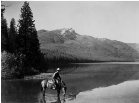
Big Salmon Lake, Flathead National Forest, (now within Bob Marshall Wilderness)

SPONSORED BY US FOREST SERVICE AND SEMITOOL