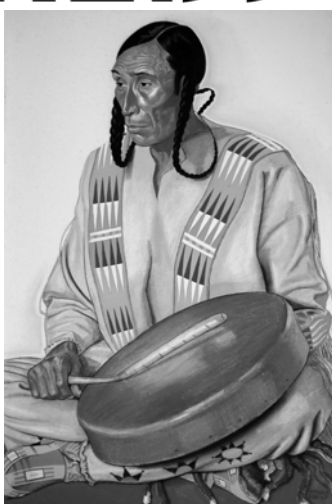
Calling First , pastel & tempera on Whatman board, 1935, 39" x 26", by Winold Reiss, Private Collection