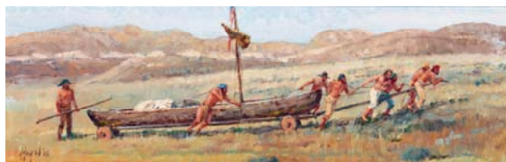
Portage , oil, by Frank Hagel Hockaday Museum of Art Permanent Collection, 2003 Purchase Award

The second in the series of Flathead Collects exhibits, Earth's Natural Treasures will feature gems, stones, fossils and more from the local "Rock Hound" club. This unique exhibition reflects on how earth's natural treasures can be viewed as both art and collectibles, especially when an artist takes a hold of them. Demonstrations on wire wrapping, gold and silver smithing, faceting, capping, gravel washing and more will take place at the opening reception on March 25 from 5:30 to 7:30 pm, on April 8 from 11:00 to 1:00 pm, and on April 17 from 11:00 to 2:00 pm.