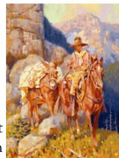
Down From the Summit, oil by R.E. Pierce, 2002 Purchase Award

Don't miss this year's Benefit Auction of Miniatures, an evening of fine art, local culinary delights and musical entertainment. This invitational fine art exhibit and benefit auction features miniature works of art 9" x 12" or smaller by some of the finest artists from across the west. Enjoy an evening of competitive fun as buyers bid to take their favorite pieces home.