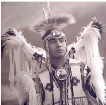
Vision