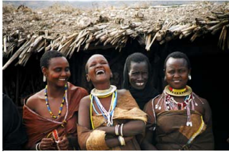
Happy in Tanzania