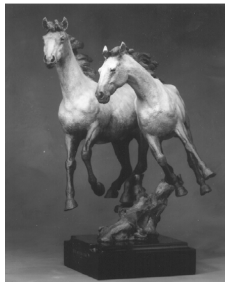
Pryor Mountain Ponies , bronze, 19 x 16 x 10 inches, by Jack W. Muir

The Hockaday Museum's Off the Wall Gift Gallery is undergoing some changes. Rather than having featured artists that change every other month, the Museum will be featuring more local artists and offering their work for sale for longer periods of time. The Museum is now looking for new artwork, especially jewelry, pottery, woodwork, glass, books, cards, journals, and other small works, to sell in the Gift Gallery. All artwork is sold on consignment, with two-thirds of the sale price given to the artist and one-third retained by the Museum to support exhibit and education programs. If you are interested in having your work sold in the Off the Wall Gift Gallery, contact Leanne at 755-5268 or information@hockadaymuseum.org .