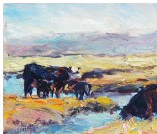
East Side Cows , oil, by Laura Miller, 2003 Members Only! Exhibit

The Hockaday Museum of Art is inviting all artists to participate in its third annual Members Only! - A Members' Salon , which is open to all media and all artists who are Hockaday members.